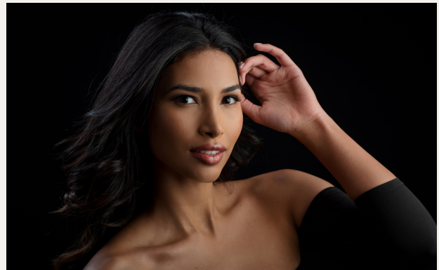
ALL ABOUT THE EYES $250

New mom? Got 5 minutes to get ready for that work Zoom? In this in-person or virtual makeup class, you learn how to get a gorgeous, pulled-together look in 5 minutes or less.