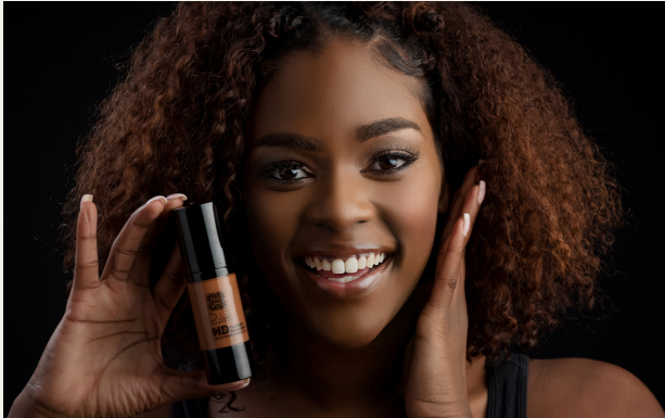
NATURAL BEAUTY $250

New job? New life? Let us makeover your makeup bag to fit with your lifestyle. In this in-person or virtual class, you will learn what works and doesn't work. We'll teach you a basic beauty look.