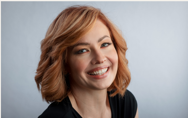
MAKEUP UNDER 5 MINUTES! $250

Frustrated with foundation and concealer? In our Flawless Face class, you learn how to get a gorgeous complexion. This in-person or virtual makeup class is the "core" for more advanced makeup to build on.